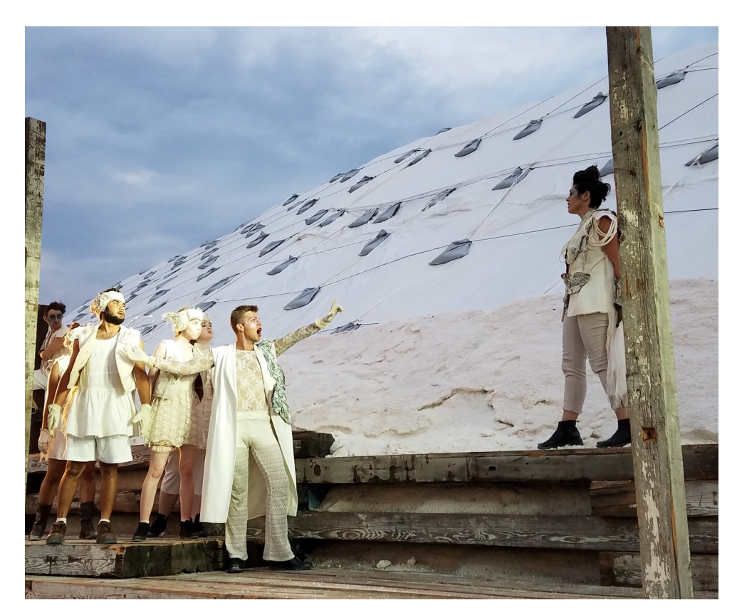
A performance of A Midsummer Night's Dream by Apollinaire Theatre Company.