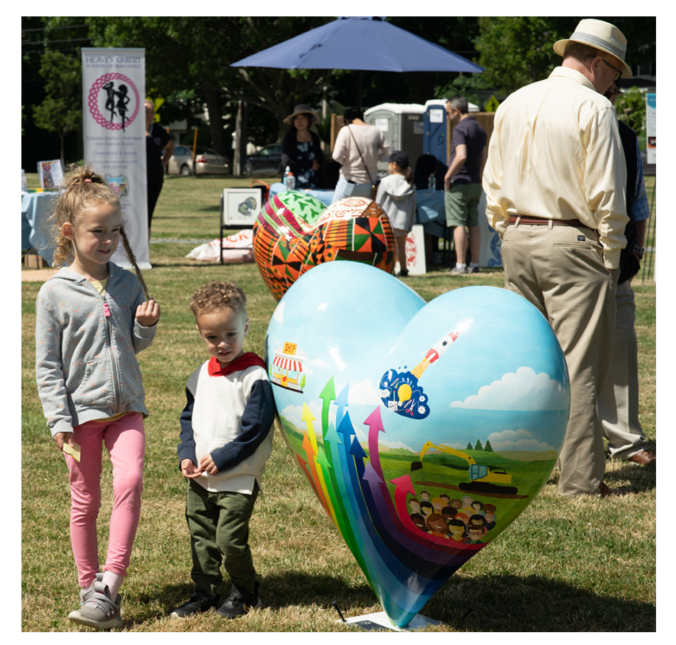
Many Cultures One Heart Festival in Framingham.

Every community in Massachusetts is served by a Local Cultural Council (LCC), led by municipally appointed volunteers who administer an annual grant program to support local cultural projects. Grant amounts vary and applications are submitted directly to each LCC.