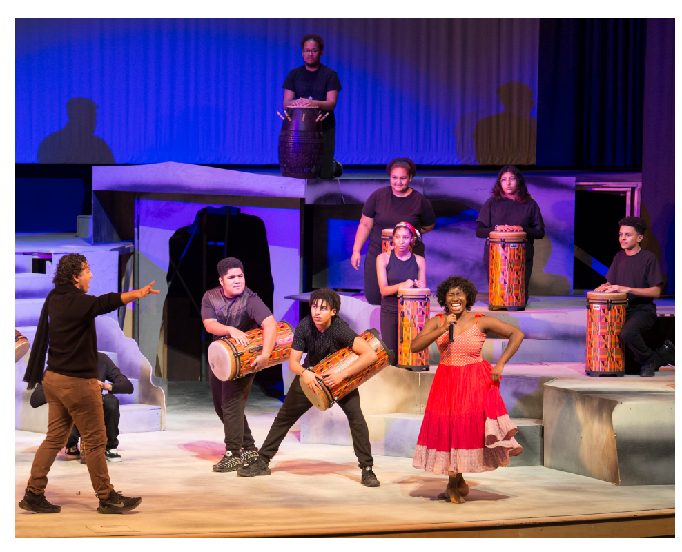
R.evolucion Latina residency with Lawrence High School.

This program, which we administer at the direction of the Legislature, provides funding to Massachusetts nonprofit and municipal performing arts centers competing with casino venues to book and host touring shows and artists.