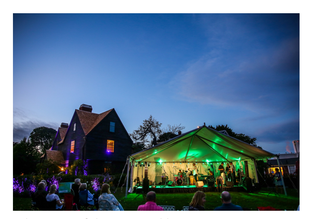
The House of the Seven Gables.